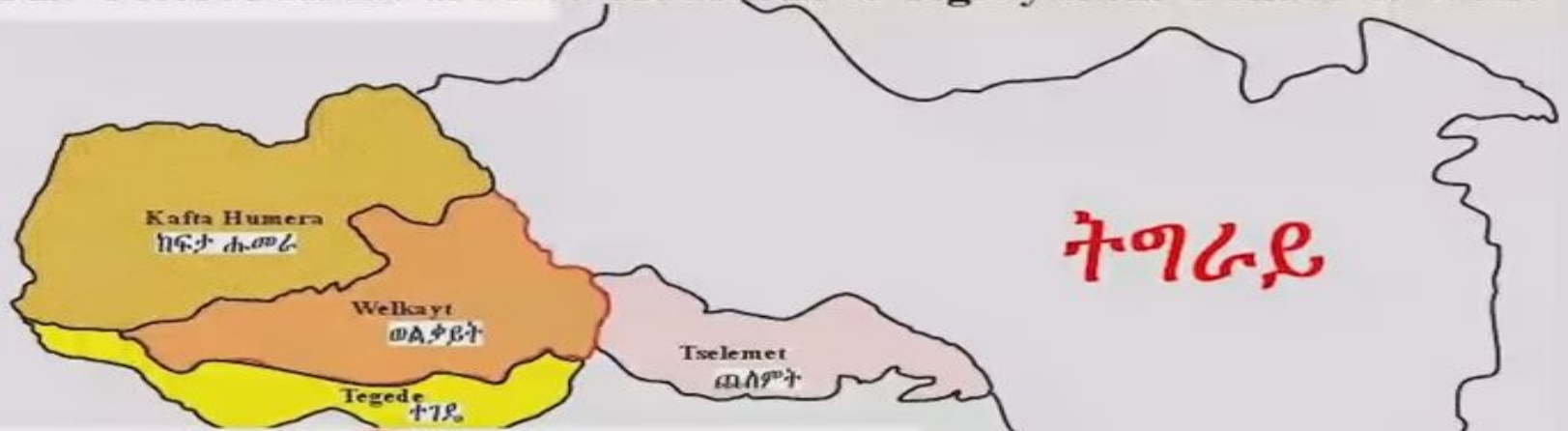
በጉንደር የተወሰዱ GONDER WEREDAS ANNEXED BY TIGRAY IN 1991

NOTE: Colored Areas are New Additions to Tigray from Gonder & Wollo